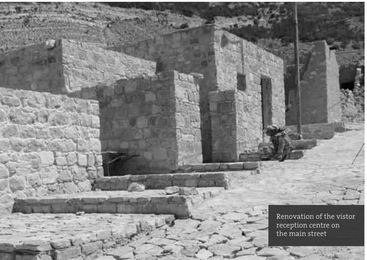
Renovation of the visitor reception centre on the main street