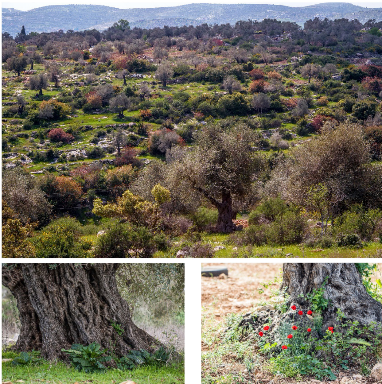
Figure 2. Ancient olive tree with synergic harmony with wild nature.

The simplified Raunkiaer method of assessment was applied to the cultivated plots and the data were calculated using the Shannon diversity indices ( H' ; S ; and E_H ) along with Margalef's index ( D ). The Braun-Blanquet (BB) method of assessment was applied to check the ecological infrastructure. The results of the three surveys are shown in Table 3.