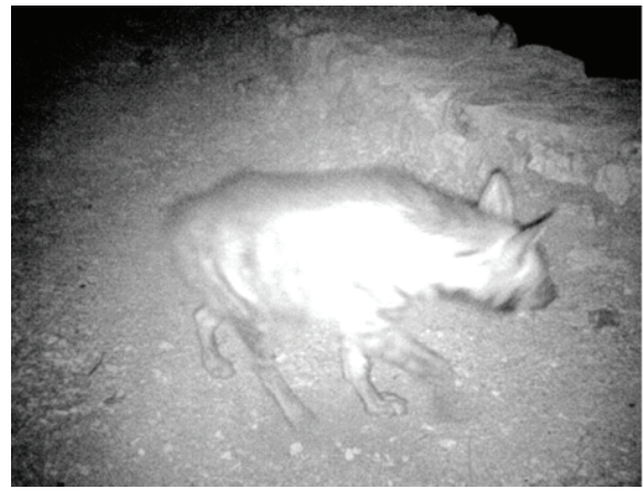
Figure 2. The Striped Hyena from Al Makhroul Valley using a night camera trap.

On February 13, 2020, the EQA brought one female hyena that was killed by a poacher and dragged behind a car. Upon autopsy, this hyena was found pregnant with