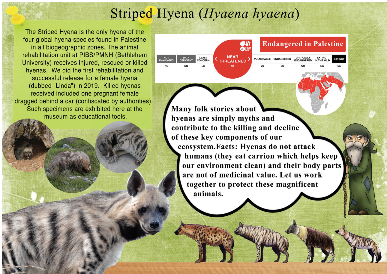
Figure 5. Hyena educational module prepared and exhibited at the Palestine museum of Natural History.

the species found in Palestine and adjacent areas such as Jordan. In the study area, there are many myths ranging from sorcery (Frembgen, 1998), to claiming humans hunt hyenas for the importance of certain hyena parts in curing illnesses (Qarqaz et al. , 2004; Frembgen, 1998).