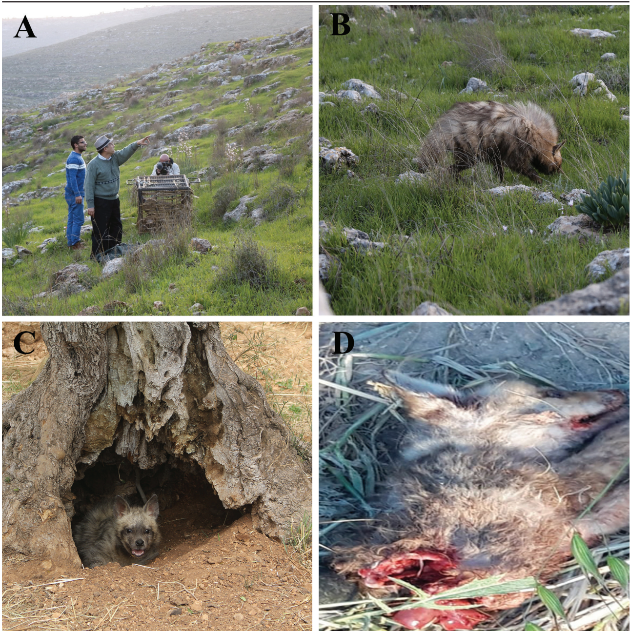
Figure 4. A-B striped Hyena released in an area to the West of Bethlehem District, C: The hyena dug under an olive tree in the enclosure during rehabilitation, D: A fox eaten by a hyena.

and environmental education and awareness in the Palestinian territories. Their efforts include animal rehabilitation and release. Their teams work with school students to create a new generation of people that respect nature to prevent and decrease infringements on wildlife. The successful story of rehabilitating and releasing a striped hyena to the wild (first of its kind in Palestine Figure 4) coupled with the pictures of the baby hyena (Figure 3) produced educational lessons. In fact, this was translated to an educational module to increase the awareness about the importance of protecting the hyena (Figure 5).