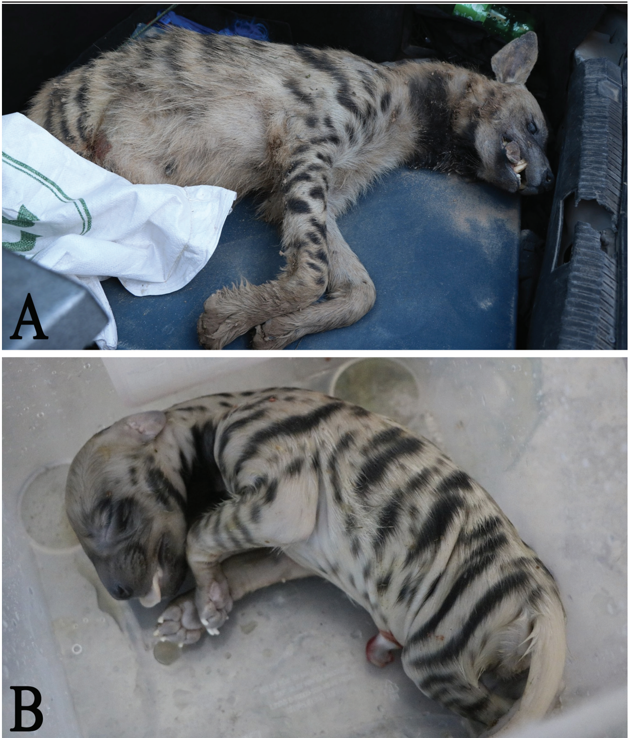
Figure 3. A: Hyena killed by a local from Al Ramadeen, B: A near-term male fetus from the dead female.

sniffing the ground and the air. On a visit week later, the researchers found tracks of the same hyena (judging by the foot print size) approximately 2 km to the west of the release site in the wooded areas near an outcropping of limestone dotted with caverns. The researchers left some food in the area one more time. This first-recorded successful release of