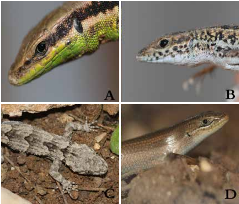
Figure 2. Some lizards from WAQ. A. Phoenicolacerta laevis . B. Ophisops elegans . C. Mediodactylus kotschyi . D. Trachylepis vittata .

The most common species of reptiles observed were Stellagama stellio and Ptyodactylus guttatus with 33 and 32 observations respectively. Stellagama stellio was the most common reptile in WAQ found mostly in exposed areas and at the margins of the wooded areas associated with rocky areas.