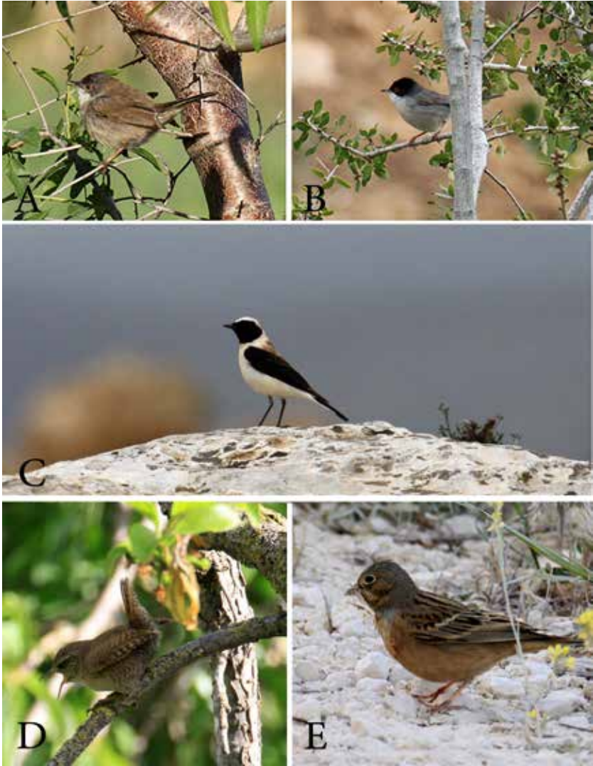
Figure 3. A. Female Sardinian Warbler foraging at WAQPA. B. Male Sardinian Warbler. C. The Black-eared Wheatear: a summer breeder at WAQ. D. Wren protecting and declaring its breeding territory. E. Cretzschmar's Bunting: a migrant and summer breeder. The bird is collecting nesting materials to build its nest at WAQPA.