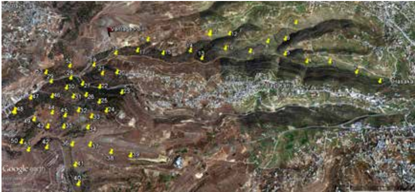
Figure 1. Location of point counts (yellow flags) and vantage point for soaring birds (red flag)