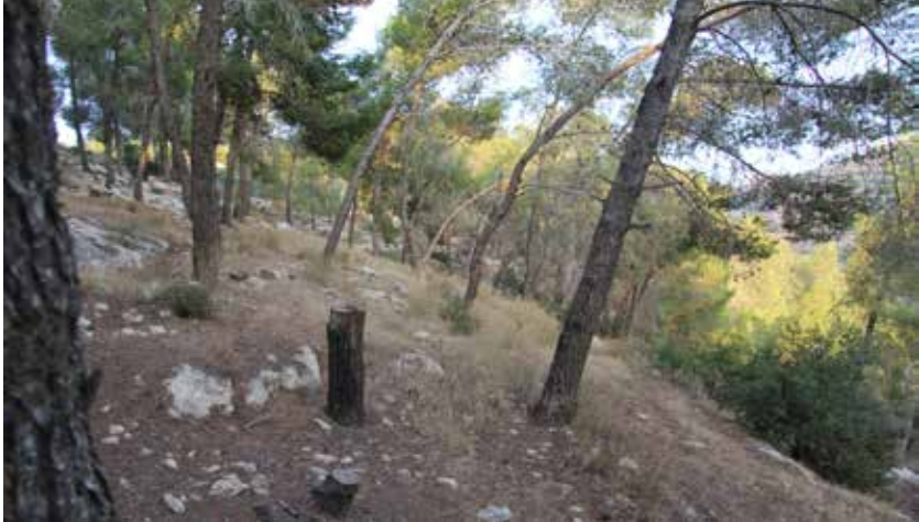
Figure 4: Some forest cutting in Area D. Habitat of Jericho giant scorpion

1) Monitoring and preventing unlawful activities. This includes tree cutting (Figure 4), dumping (Figures 5), hunting (we noted shells of khartoush guns), overgrazing, and taking of products from the forest without license (plants, mushrooms, etc).