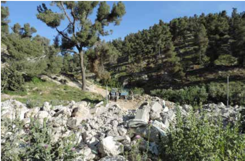
Figure 5: Illegal dumping near area 7