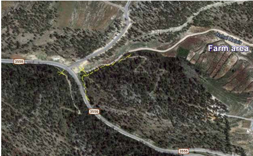
Figure 3: Suggested alterations to critical areas (for areas 5, 6, and 7). Either blockage of dirt access roads at yellow X mark and/or apply fence to protect areas on both sides of the road below the X.

2) Block roads and/or limit access in some areas of WAQ. This is especially helpful in the valley leading to Ain Hasaka and to areas below Beit Kahil Safa park. At least two blocks can be established for vehicles. Another option is to apply a fence to protect areas on both sides of the road below the x marks in figure 3. These are areas of high biological/biodiversity value.