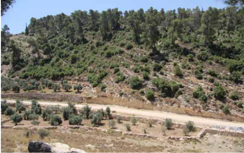
Figuer 2: Area 6 habitat.

Area 7. Area centered at Lat 31° 34' 44" Long 35° 2' 11". Area 7 is to the south of the road from Tarqumia to Beit Kahil and has a very rough dirt road (only navigated by 4-wheel drive) that separates it into two areas: we call them 7a and 7b (Figure 4). Because of the terrain being not very accessible, it seems this area provided a natural protected area of WAQ. Here we recorded many of our lizard species and also here is where the rare Mediodactylus (Cyrtodactylus) kotschyi Mediterranean Thin-toed Gecko was found. This represents the southern-most record of this species and while IUCN does not consider the species of concern, in this area it is likely threatened (we noted only one specimen even after significant search). Also we noted the locally rare Snake-eyed lizard Ablepharus rueppellii . Another notable finding in this area is the tiny land snail of the genus Ena . The area is also foraging ground for the bats.