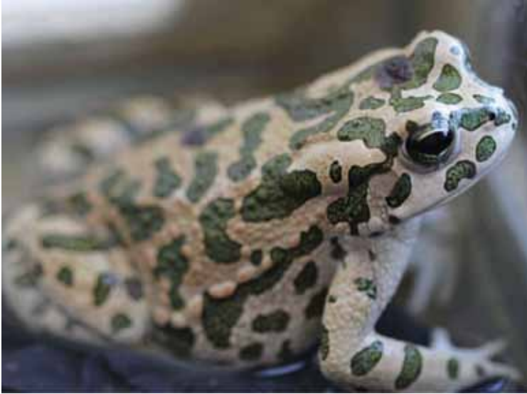
Fig. 2: Bufotes variabilis from Beit Sahour.

also reported this species from a cave at Idnah, Hebron district. Locals recognize this species as coming out after the initial winter rains.