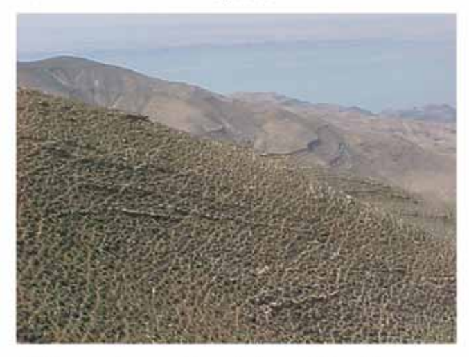
B : Retama raetam vegetation calss in association with Urginea maritima