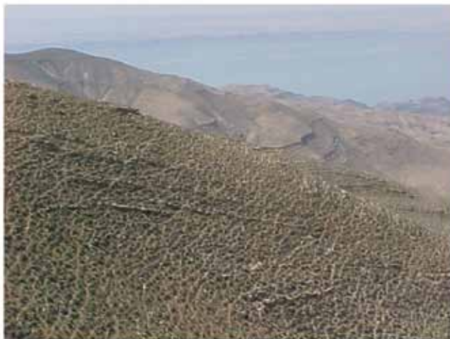
B: Retama raetam vegetation calss in association with Urginea maritima